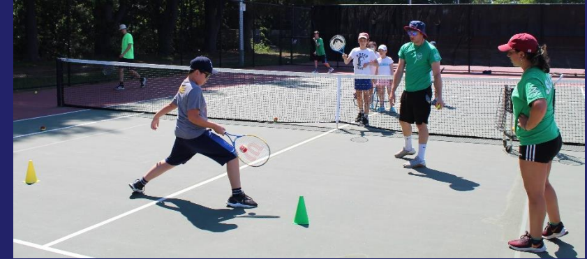
Gallagher Tennis Courts