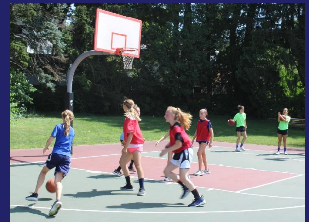
Farias Basketball Courts