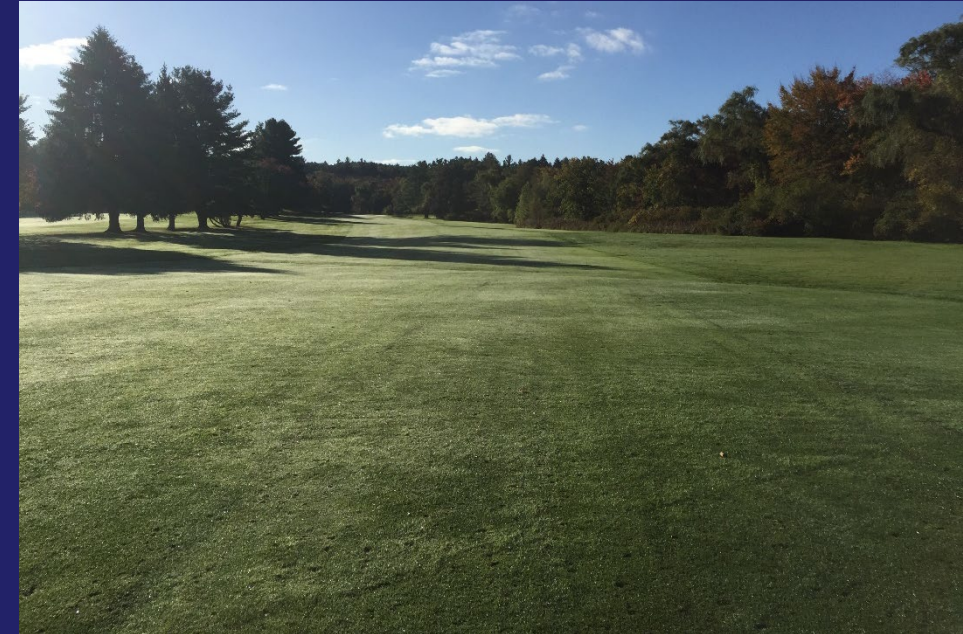
Pine Meadows – 2 nd Fairway