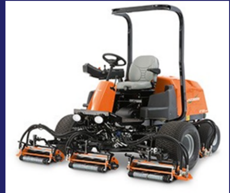
Jacobson Fairway Mower