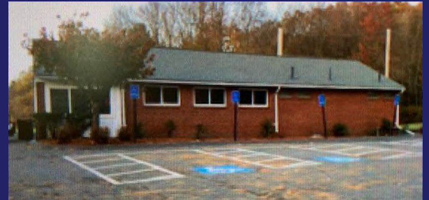
Pine Meadows Clubhouse