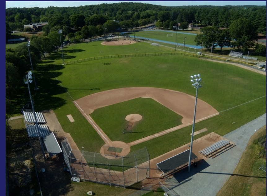
Center Recreation Complex