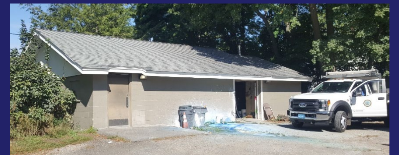
Center Bathrooms/ Maintenance Building