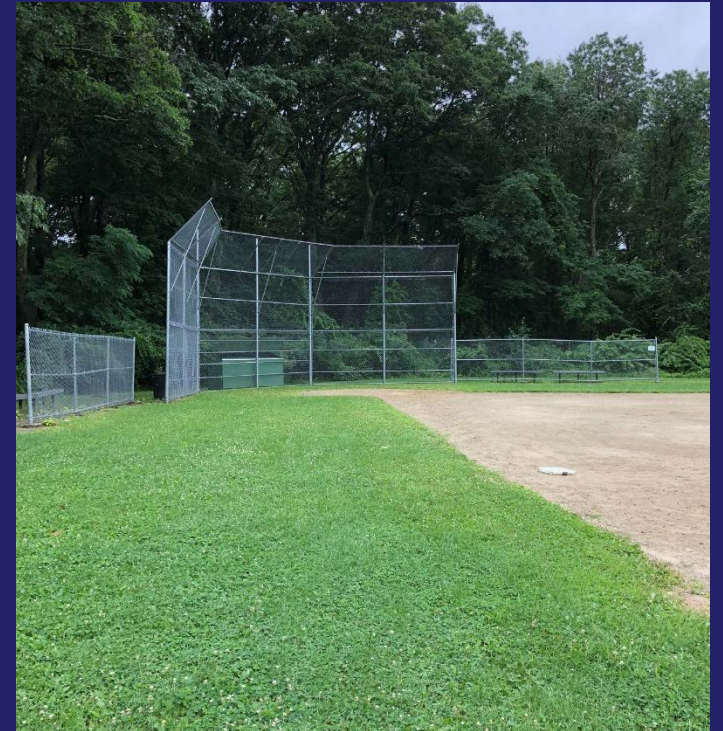
Bridge School Fields