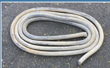
SOLID LEAD PIPE

Lead was a common construction material for water services in the 1800s and early 1900s until the 1986 lead ban. There are three main types of lead service lines: